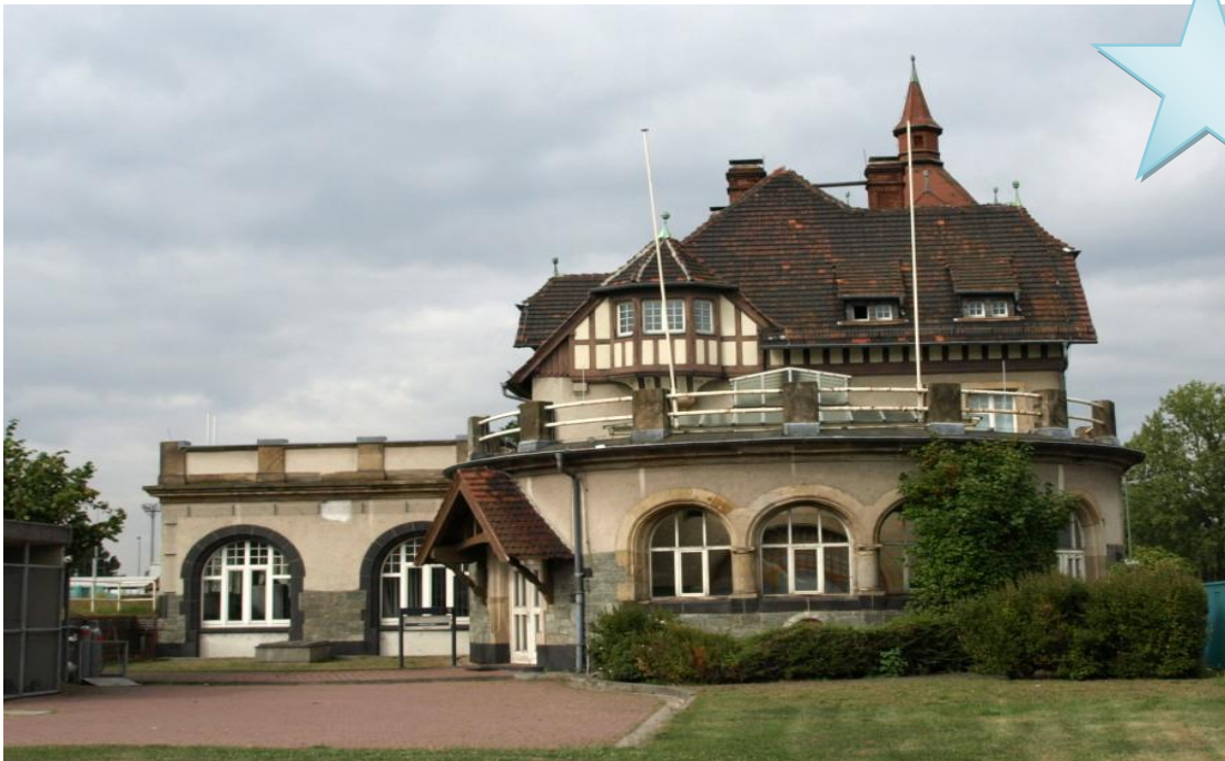
The main historical building