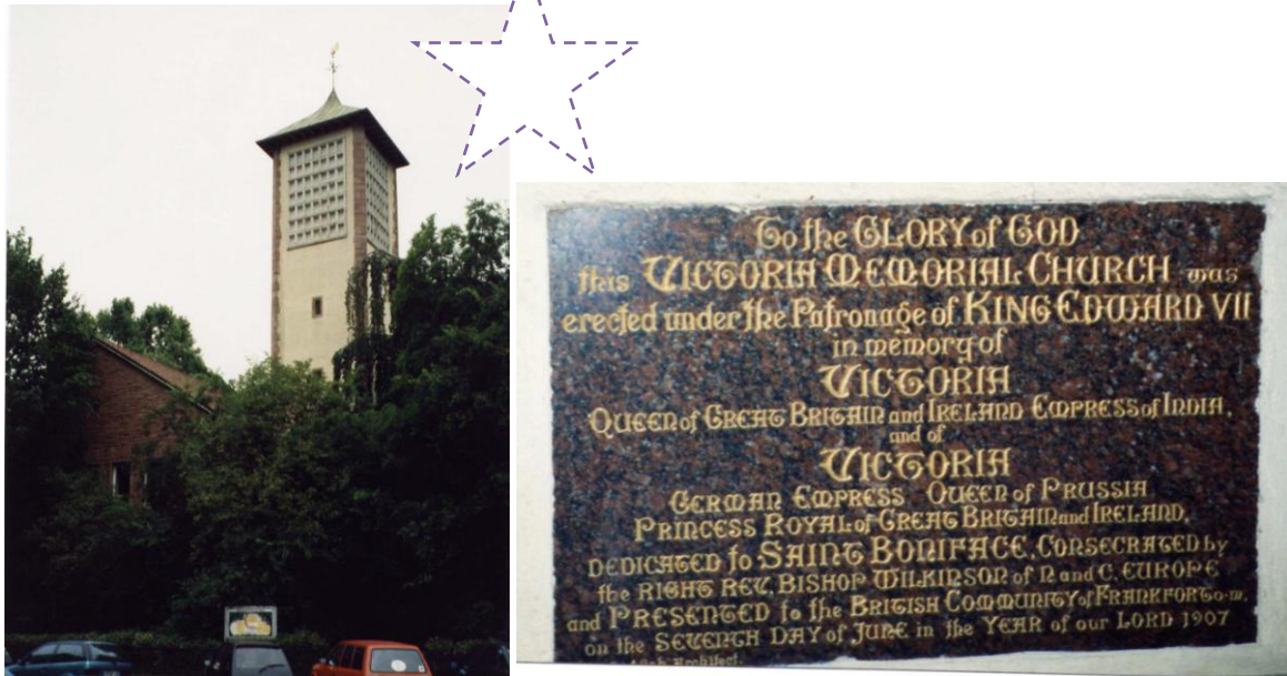
The Church (1998) and the plate (then on the wall of the church tower)

This day was on me (Ryszard). We went to Evangelical Reformed Church - West (Deutsch Evangelisch-Reformierte Kirche) on Freiherr vom Stein Strasse No. 8 , (former Church of England) founded by William Heerlein Lindley. It was very disappointing since the church is gone and replaced by a big modern religious center of Evangelical Reformed Church.