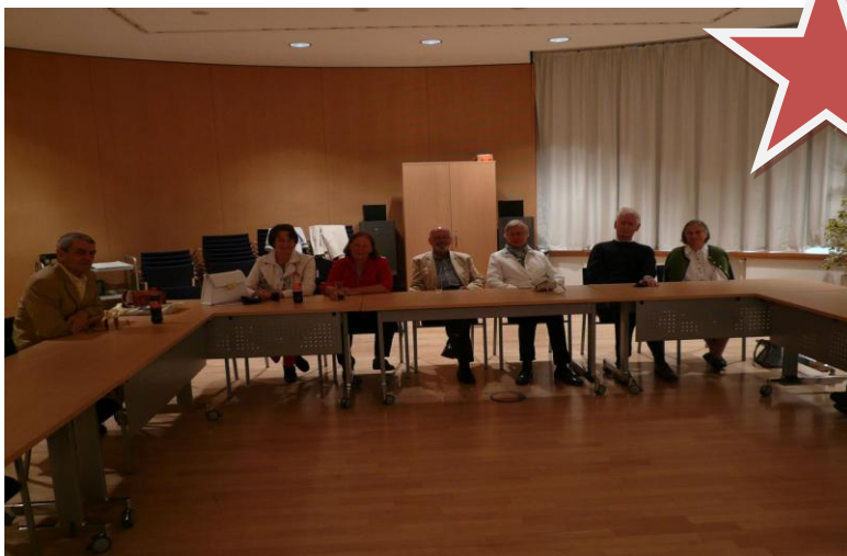
Niederrad. Conference room

On all locations we were treated with lunches (drinks and sandwiches). But most of all, we were treated with great esteem and were able once more to realize how important the Lindleys were also for this city.