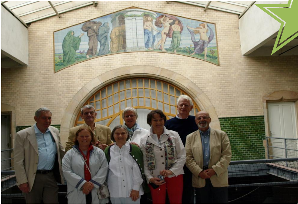
Inside of the old building