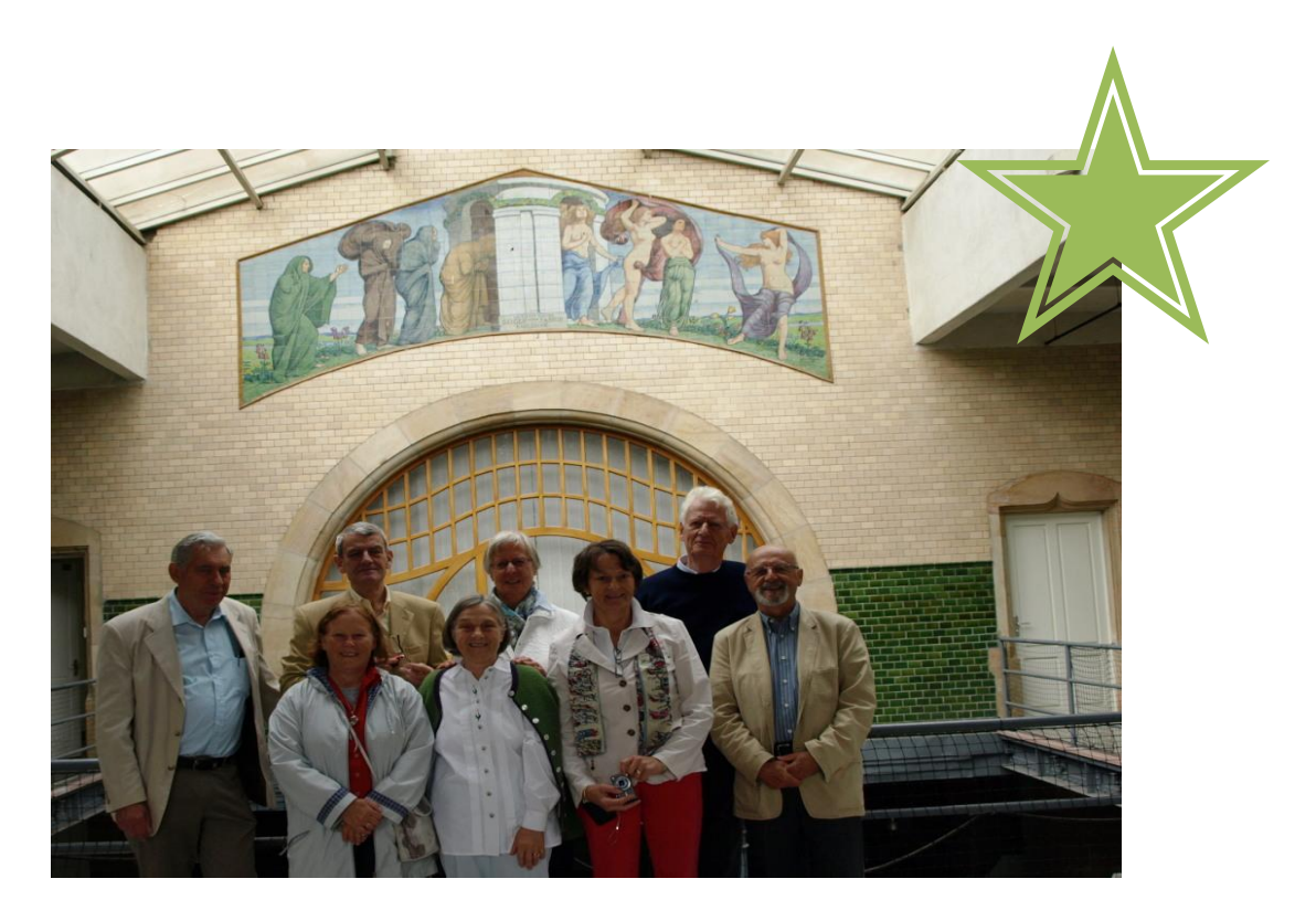
Inside of the old building