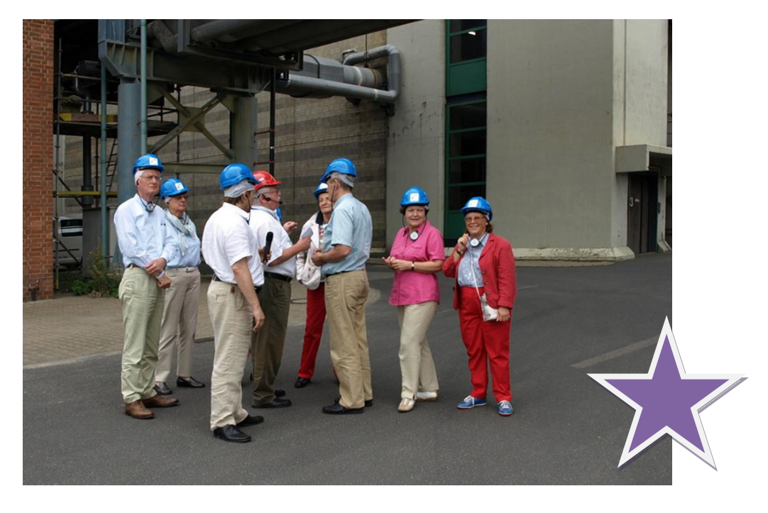
Everyone enjoyed blue helmets and earphones for not being hurt or lost

That night we went to Apfelwein Klaus at Kaiserhofstrasse 18/20 for local delicacies, among them – of course – apple-wine!