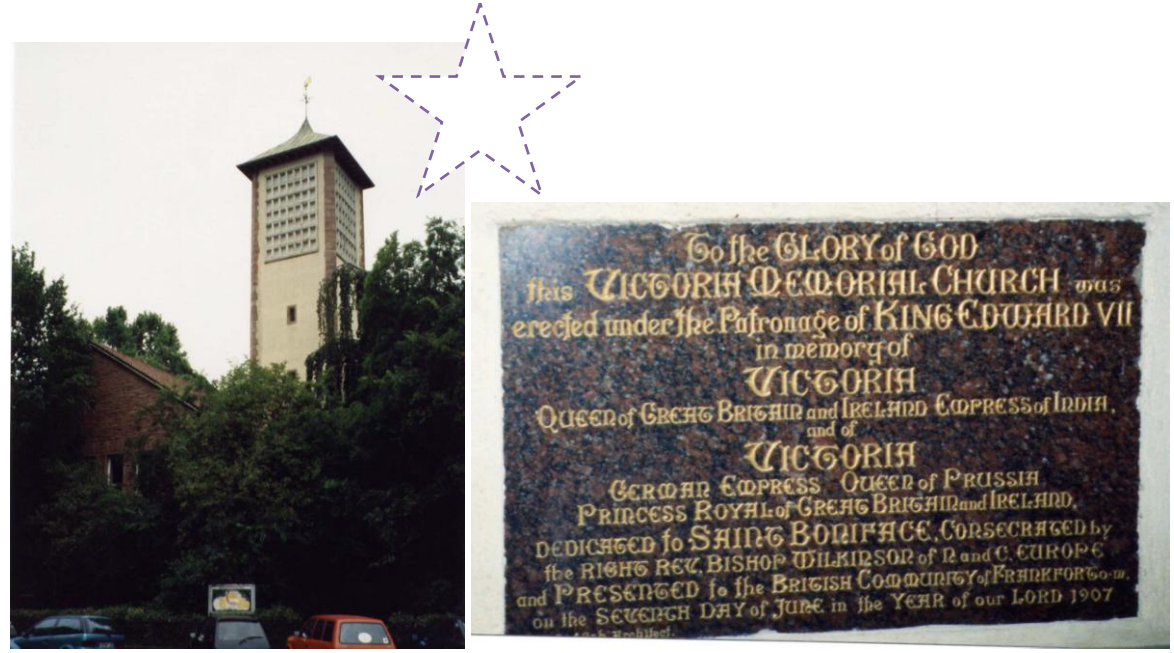
The Church (1998) and the plate (then on the wall of the church tower)

his day was on me (Ryszard). We went to Evangelical Reformed Church - West (Deutsch Evangelisch-Reformierte Kirche) on Freiherr vom Stein Strasse No. 8 , (former Church of England) founded by William Heerlein Lindley. It was very disappointing since the church is gone and replaced by a big modern religious center of Evangelical Reformed Church.